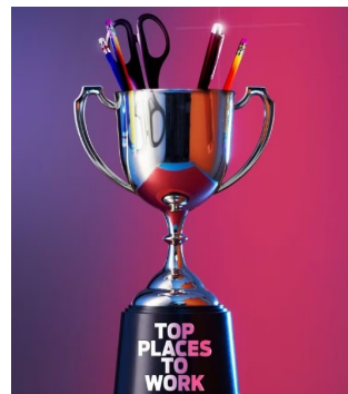
The Boston Globe

This year's list of 175 honorees was compiled from employee survey data and divided into four categories. Read more online.