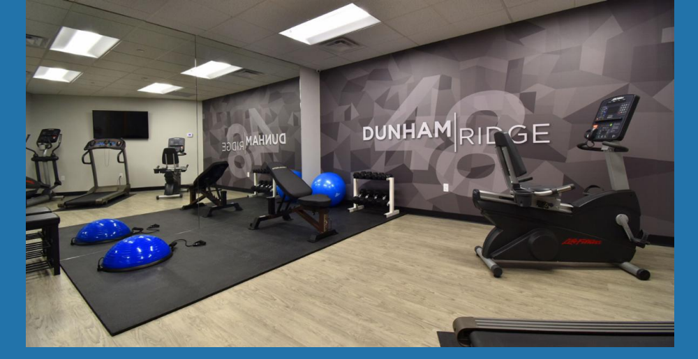
On-site Fitness Facility: The fitness room at 48 Dunham Ridge has reopened. This small gym features equipment for both cardiovascular and strength-training workouts, including a weight bench, free weights, and a weight ball as well as a treadmill and elliptical and stair climber machines. It also houses mats and a flat screen television, and has two adjacent restrooms outfitted with shower stalls.