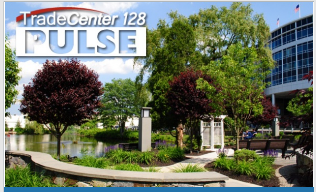
Client news, reopening resources, and more