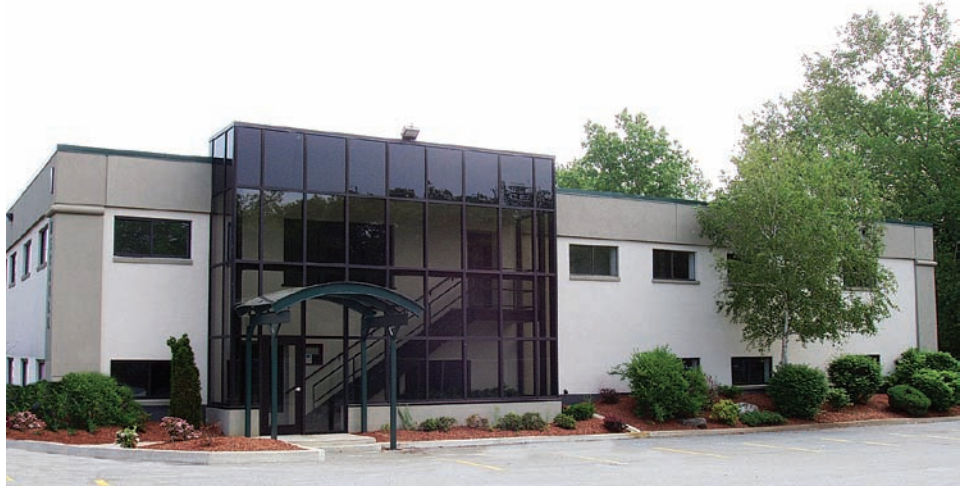
1 Merrill St., Woburn MA