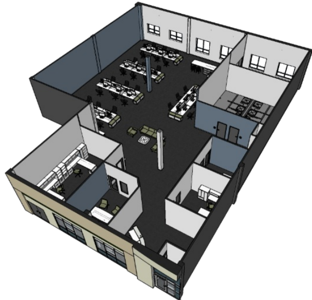
Sample overhead rendering